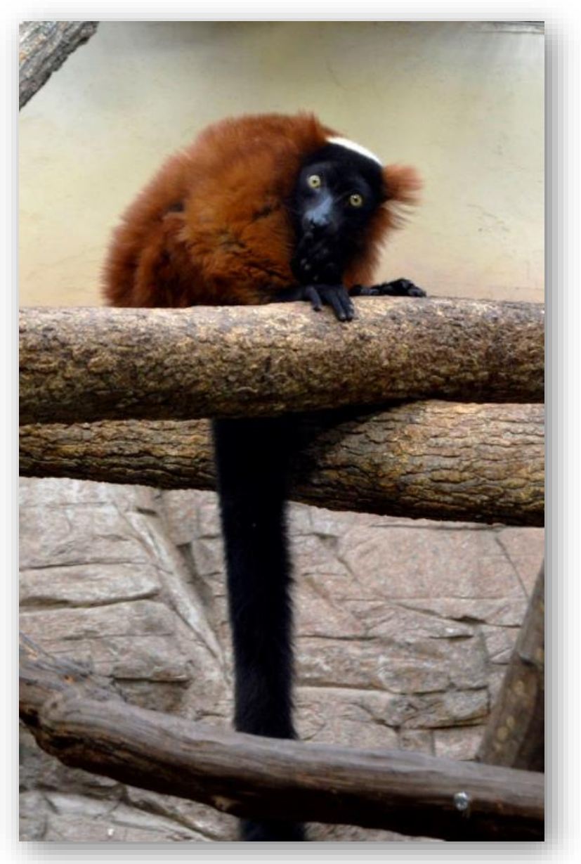
I may hear some animals making loud noises like the howler monkeys and red-ruffed lemurs.